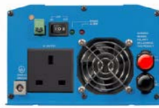
Phoenix Inverter 12/800 with BS 1363 socket