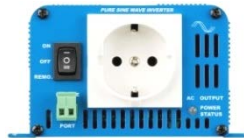
Phoenix Inverter 12/180 with Schuko socket