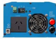
Phoenix Inverter 12/800 with AN/NZS 3112 socket