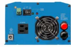
Phoenix Inverter 12/800 with Nema 5-15R socket