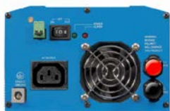
Phoenix Inverter 12/800 with IEC-320 socket