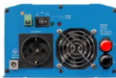
Phoenix Inverter 12/800 with Schuko socket